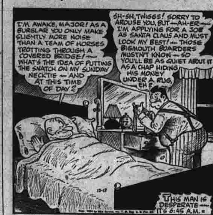
BY MAJOR HOOPLES