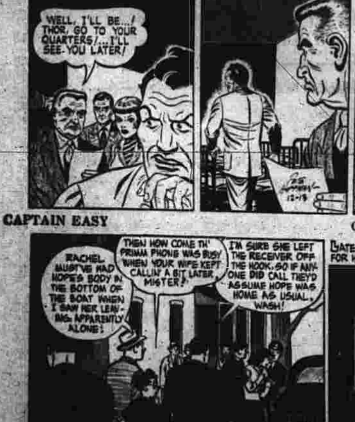
BY PETER HOFFMAN