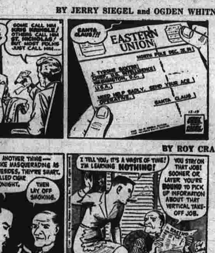
BY LANE LEONARD