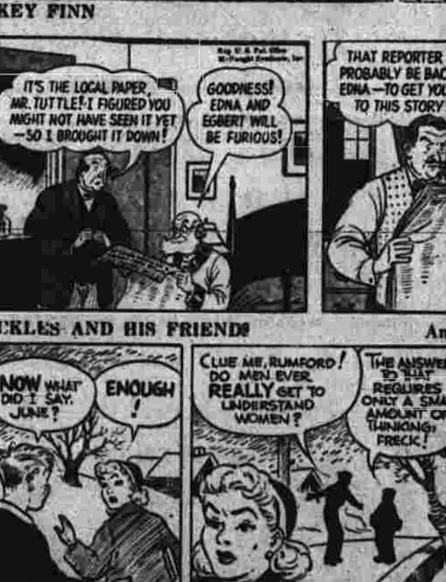
BY MERRILL C. BLOSSER