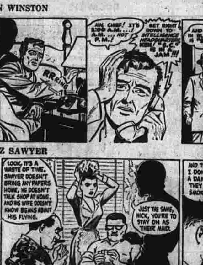
BY JERRY SIEGEL AND OGDEN WHITNEY