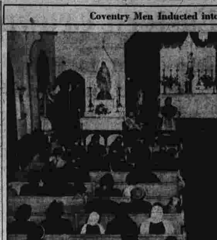
Coventry (Special)—At impressive ceremonies last evening in St. Mary's Church nearly 20 local men were installed as members in the Holy Name Society.