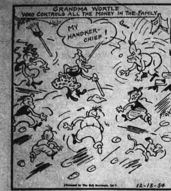
GRANDMA WORTLE WHO CONTROLS ALL THE MONEY IN THE FAMILY